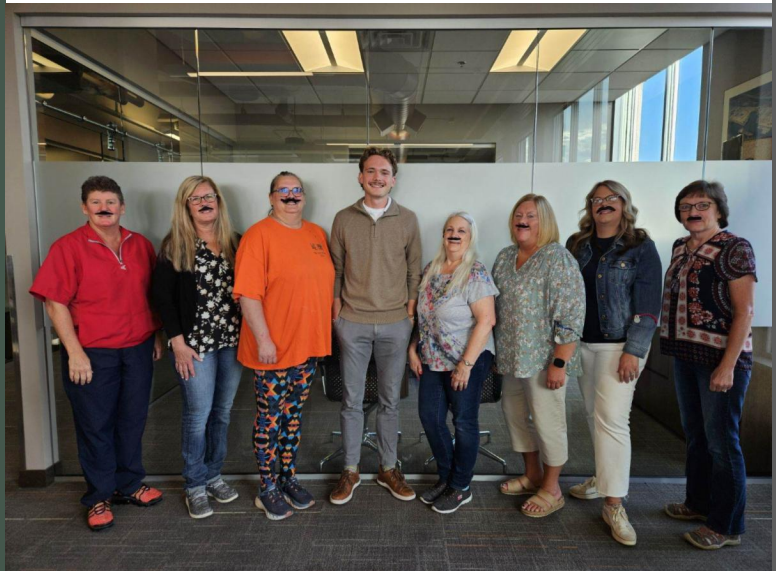
Mustache Mention : Office Fun