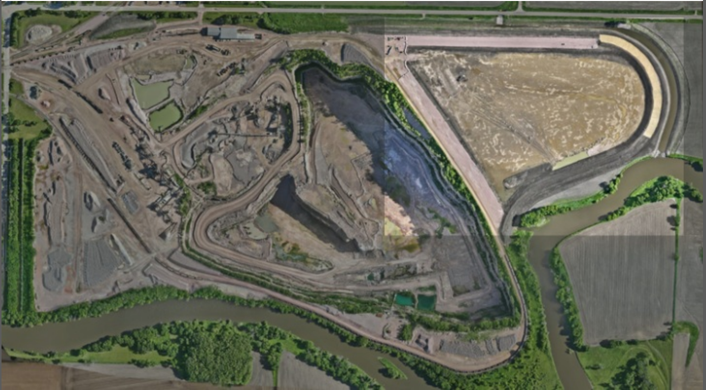
"The Bubble" along the perimeter of the Dells East Quarry.